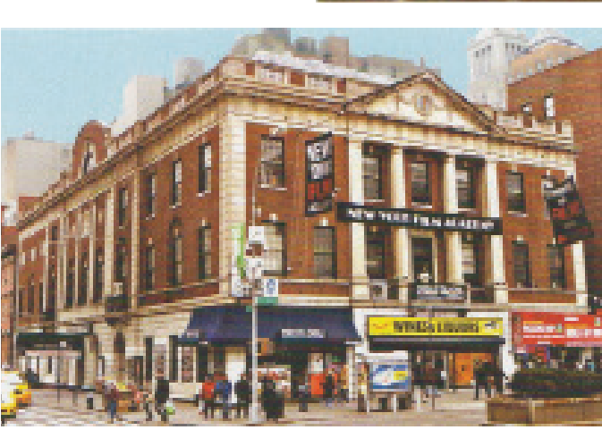
Former Tammany Hall

we find the former headquarters of The Century and St. Nicholas magazines in a fine Queen Anne style building (1881), now a major Barnes and Noble multi-story retail location. A door or two east, observe that at 200 East 17th Street on the corner of Park Avenue South, the tall Everett Building of corporate offices (1908), built on the site of the venerable Everett Hotel, has the topmost floors of the two principal facades decorated with rose-colored terracotta